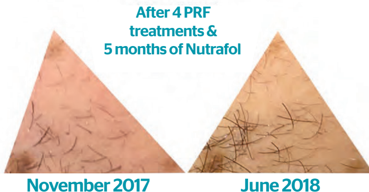
Figure 1 Before and after PRF for hair loss

► For more information on ezPRF, visit: cosmofrance.net